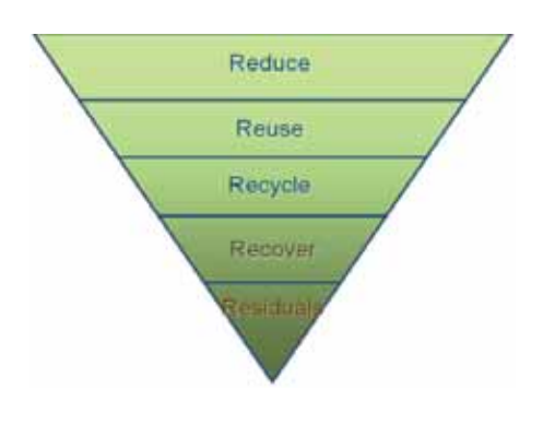
Figure 1 – The Waste Hierarchy

As implied by the above definition, critical to the concept of zero waste is the exclusion of waste disposal in either a landfill or WTE facility. Figure 1 below represents the 'waste hierarchy'. The first three Rs — Reduce, Reuse and Recycle — form the foundation of a zero waste approach. Materials that cannot be reduced, reused or recycled are considered residuals. The long-term objective of a zero waste approach is to eliminate materials from the waste stream. The fourth R, recover, implies recovering the embodied energy in a material by processing it in a WTE facility. It is an important distinction to note that this is considered a final disposal method and is not an alternative to recycling.